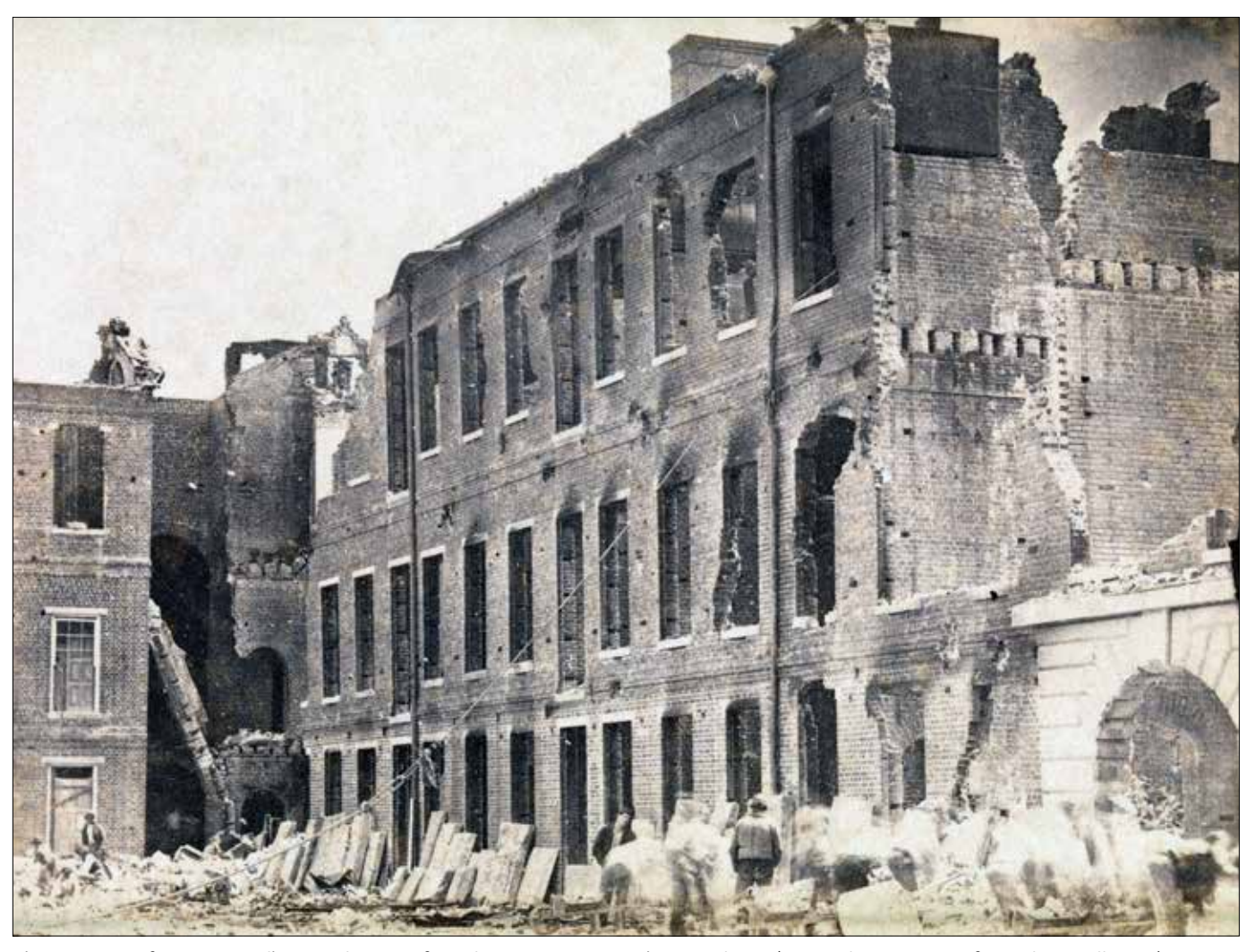
The Evacuation of Fort Sumter, albumen silver print from glass negative, J.M. Osborn, April 1861 (Metropolitan Museum of Art/Gilman Collection)

and under such circumstances as such employment of said force may be expressly authorized by the Constitution or by act of Congress.<sup>29</sup>