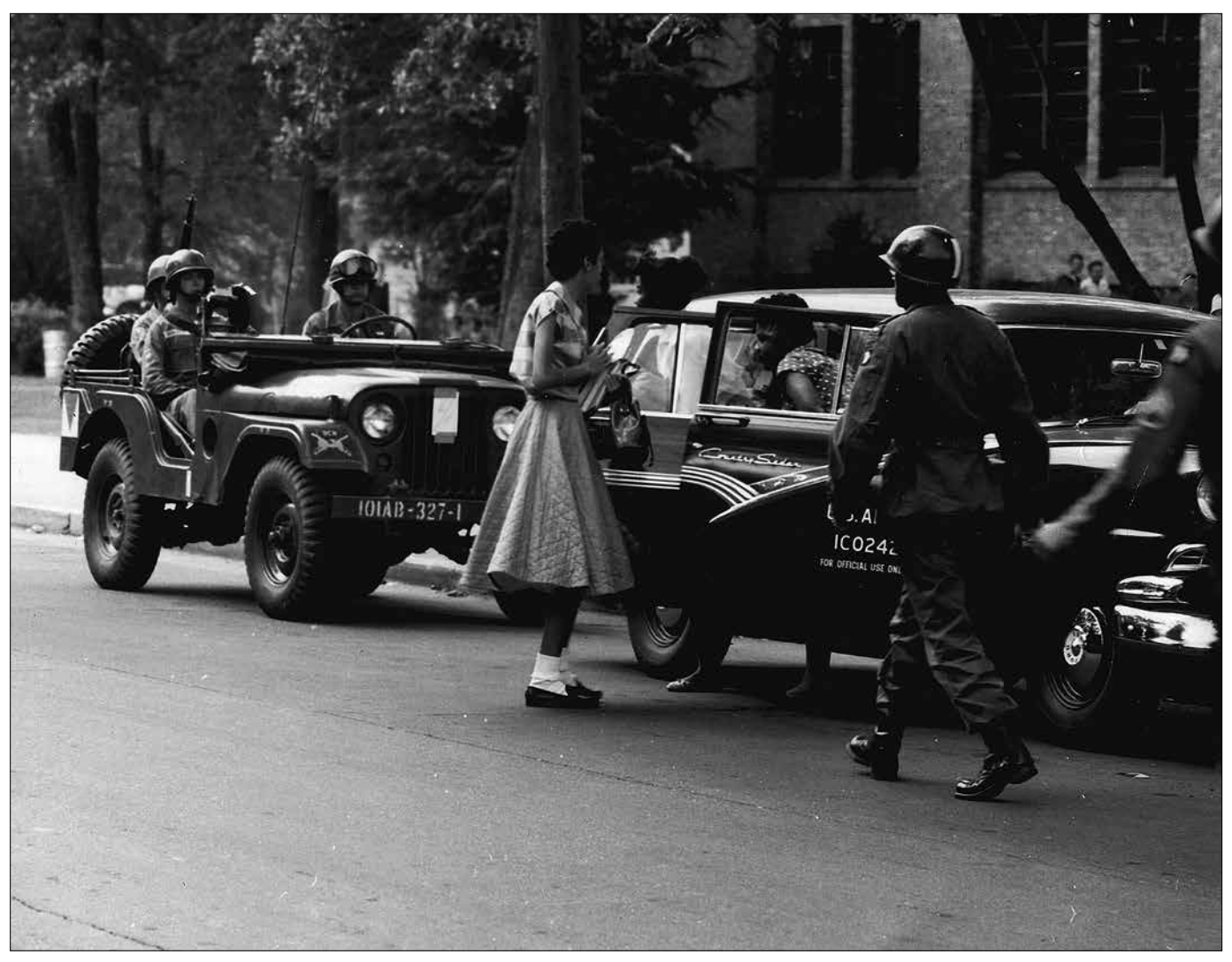
Within 1 hour of President Eisenhower's decision on September 24, 1957, Soldiers from 1st Airborne Battle Group, 327th Infantry Regiment, deployed to Little Rock, Arkansas, to escort nine Black high school students into formerly segregated Central High School amid racial protests

newly established Federal Government to suppress violent resistance to its laws. After negotiations failed to resolve the dispute, Washington requested certification from a Supreme Court justice that local law enforcement could no longer enforce the law. He then issued a proclamation in August indicating that he would raise a militia and demanded the Pennsylvania insurgents disperse by September 1. Washington, with the governor's support, assembled 13,000 militiamen from Pennsylvania and three other states. As the army marched west, the rebels dispersed.<sup>11</sup> When the army remained in the field as Congress came into session, legislators reauthorized the calling forth of the militia for an additional 3 months. Yet, to allay concerns